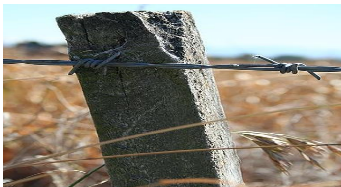
Figure 2: Illegal Fence identification

Most of the deaths occurred because of shocks coming from broken electric lines. Indeed, even the fences that have been gotten up in a position produce creatures ending their lives. The vast majority of the electric fences are working without the information on Electrical Inspectorate[7]