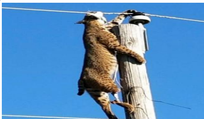
Figure 1: Electrocutation on distribution power lines

At the point when a suitable electric flow is gone through the body of animal into a state called as ventricular fibrillation. This react to cardiac arrest happen that implies heart beating and immediately end the pumping blood [1]. Wild animal got collapse while touching the fence and become no movement of action, it leads to death. Electrocutation affects the life of wild animals .This may be caused by faulty electrical circuit connections, lightning fallen in the electrical line.