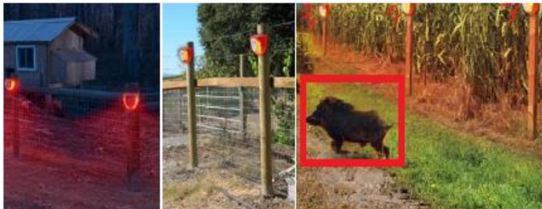
Figure 4: Wild animals detection with alarm warning with flicker flame lights

Latest Designed Flickering effect with a Safe alternative as Real Flickering Flames Design [10]. The solar post light with automatic photosensitive design including waterproof and heat resistant. Flickering Solar Lights Outdoor having facilities such as Energy saver and Simple disassembly. Robust Glass Material with Shock resistance with Rough Handling and Auto On/off From day to midnight [8,9].