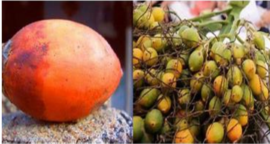
Figure 2: Raw Arecanut

Figure 2.demonstrates an unprocessed, raw arecanut. Raw arecanuts are either ripe or delicate nuts that still have their outer shell on. For marketing purposes, these raw arecanuts must be processed. Even the nuts' outer shells are valuable and can be utilized for a variety of things. Numerous researchers are engaged in it..