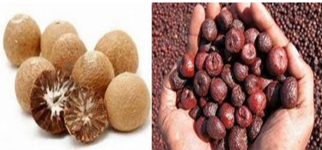
Figure 3: Partially Processed and Completely Processed Arecanut

Figure 2.demonstrates an unprocessed, raw arecanut. Raw arecanuts are either ripe or delicate nuts that still have their outer shell on. For marketing purposes, these raw arecanuts must be processed. Even the nuts' outer shells are valuable and can be utilized for a variety of things. Numerous researchers are engaged in it..