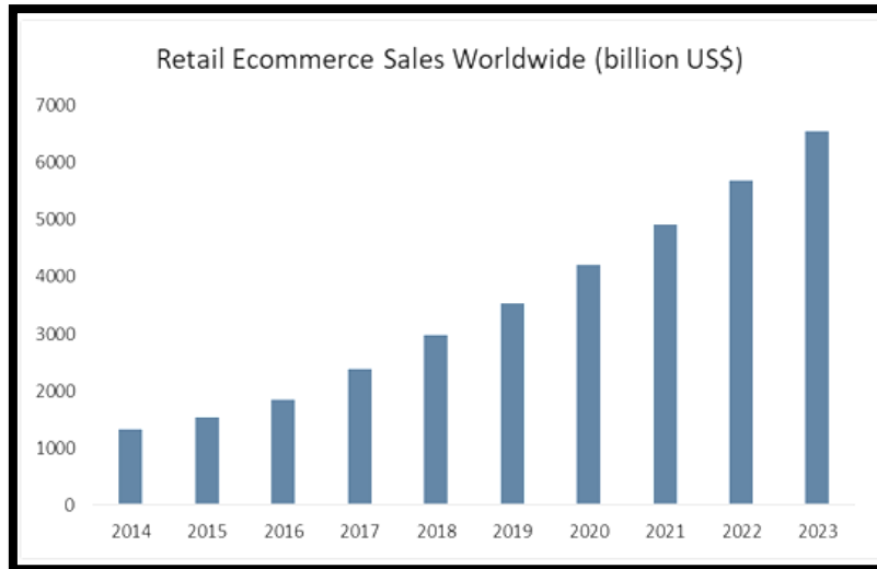
Figure 1: Retail e-commerce Sales Worldwide (2014 – 2023) (Statista, 2020)

From the retailers point of view too, online retail proves to be beneficial since it saves spend on real estate while at the same time it increases the customer reach. From the customer perspective there are certain momentous reasons for them to prefer online shopping: