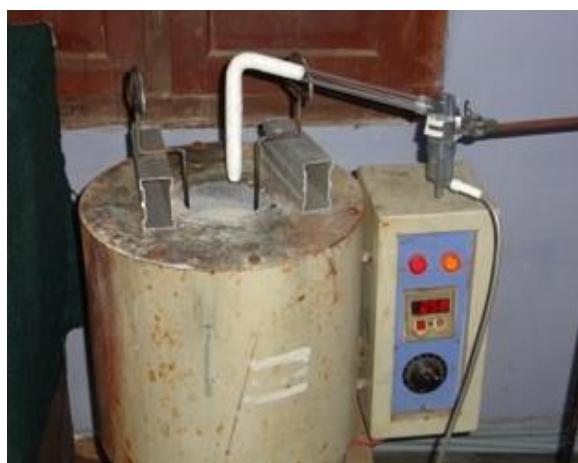
Figure 2: Photograph of experimental technique

The first component is the bottom section, which has a 0.5 mm-diameter micro air nozzle and a compressed air intake. This is the crucial component of the nebulizer. This nozzle behaves like a jet air nozzle and exhales air at a very high speed when air at high pressure is applied through it. This explains why the device is called a "Jet Nebulizer." The first half of the Jet air nozzle is installed in the second section, a specifically made liquid sucking unit with a tiny hole and a striker target tip in the top portion. The third one is the top section, which has a 1 cm diameter tube running from top to bottom as well as an exit for releasing aerosols. Figure 1.2 is a snapshot of an experimental Jet Nebulizer setup.