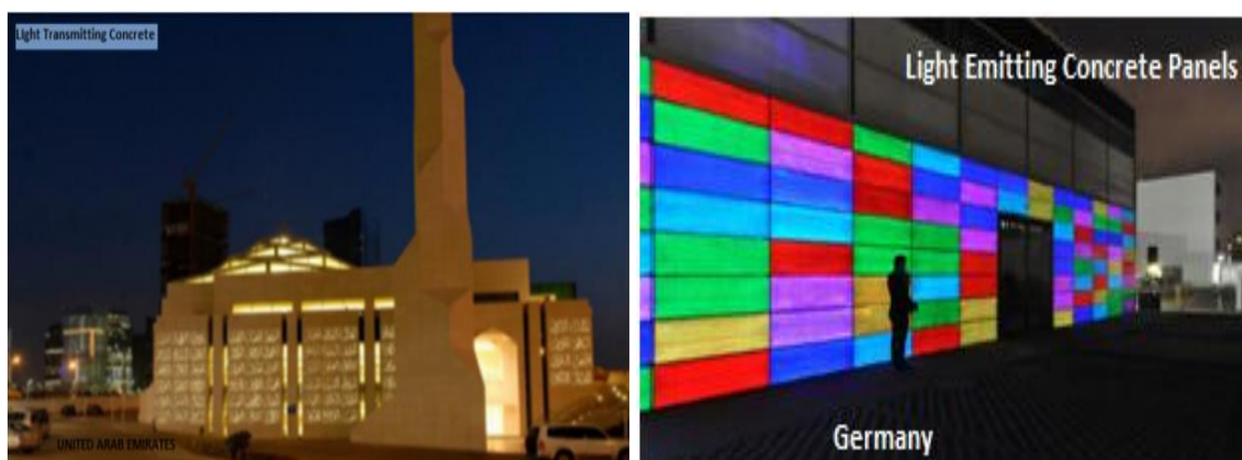
Figure 1a & b: Light Transmitting Concrete

According to Rubio, modification of micro-structure of the cement is required by allowing the concrete to absorb solar energy during the day and re-emit it as light. The intensity of blue and green colors can also be adjusted as per the user's needs and this kind of material can last up to 100 years [27].