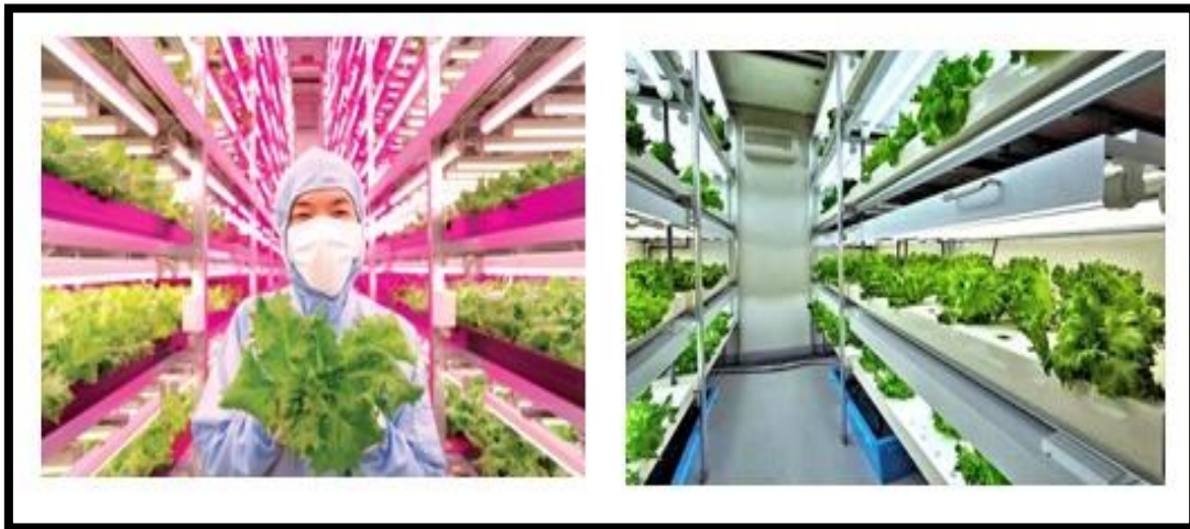
Figure1: Lettuce Production using Grow Light

According to Hikosaka et al. [7], tomato plants with one and two leaves exposed to supplemental LED lighting had photosynthetic rates that were 12 per cent and 28 per cent greater than the control (only top lighting)