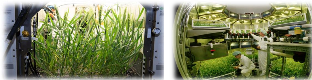
Figure 3: Controlled-environment agriculture (CEA) technologies

The benefits of CEA technologies, include increased crop yield annually due to quicker culture period under ideal environmental conditions and year round cultivation, greater growing area per m 2 through multi-tier cultivation shelves and more plant density, efficient nutrient and water use, lessened crop losses, and absence of pesticide application, make them effective for crop production. Additionally, these technologies might result in the production of typical, high quality horticultural goods. Closed and interior plant cultivation, in contrast to outside agriculture, rely on cutting-edge light sources like LEDs that can stimulate plant growth while significantly lowering energy use.